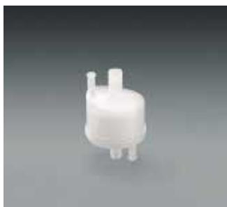
Type RO, with G3/8 male thread inlet and hose nipple outlet

* Also available as mini cartridges with the same pore sizes and areas.