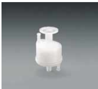
Type SO, with sanitary flange inlet and hose nipple outlet