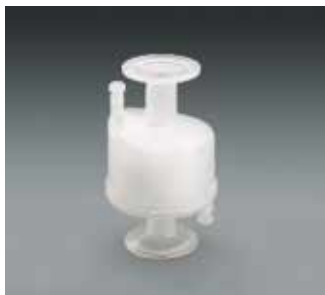
Type SS, with sanitary flange inlet and outlet