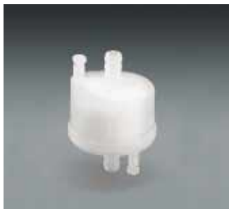
Type OO, with hose nipple inlet and outlet