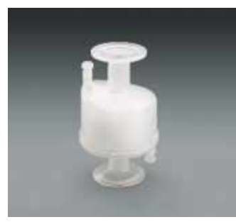
Type SS, with sanitary flange inlet and outlet

Type 00, with hose nipple inlet and outlet